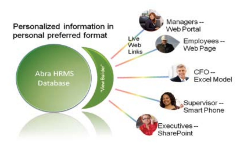
Figure 2: Sage Employee Analytics in multiple formats

The implication is that manager A can integrate and view his or her information on an iGoogle<sup>™</sup> page, manager B views and analyzes his or her information in an Excel spreadsheet, and manager C views his or her information on a mobile device such as an iPad<sup>®</sup>, iPhone<sup>®</sup> or Blackberry<sup>®</sup>. A view created just once will show the information relevant to the person who accesses the information, and in the format of their personal preference.